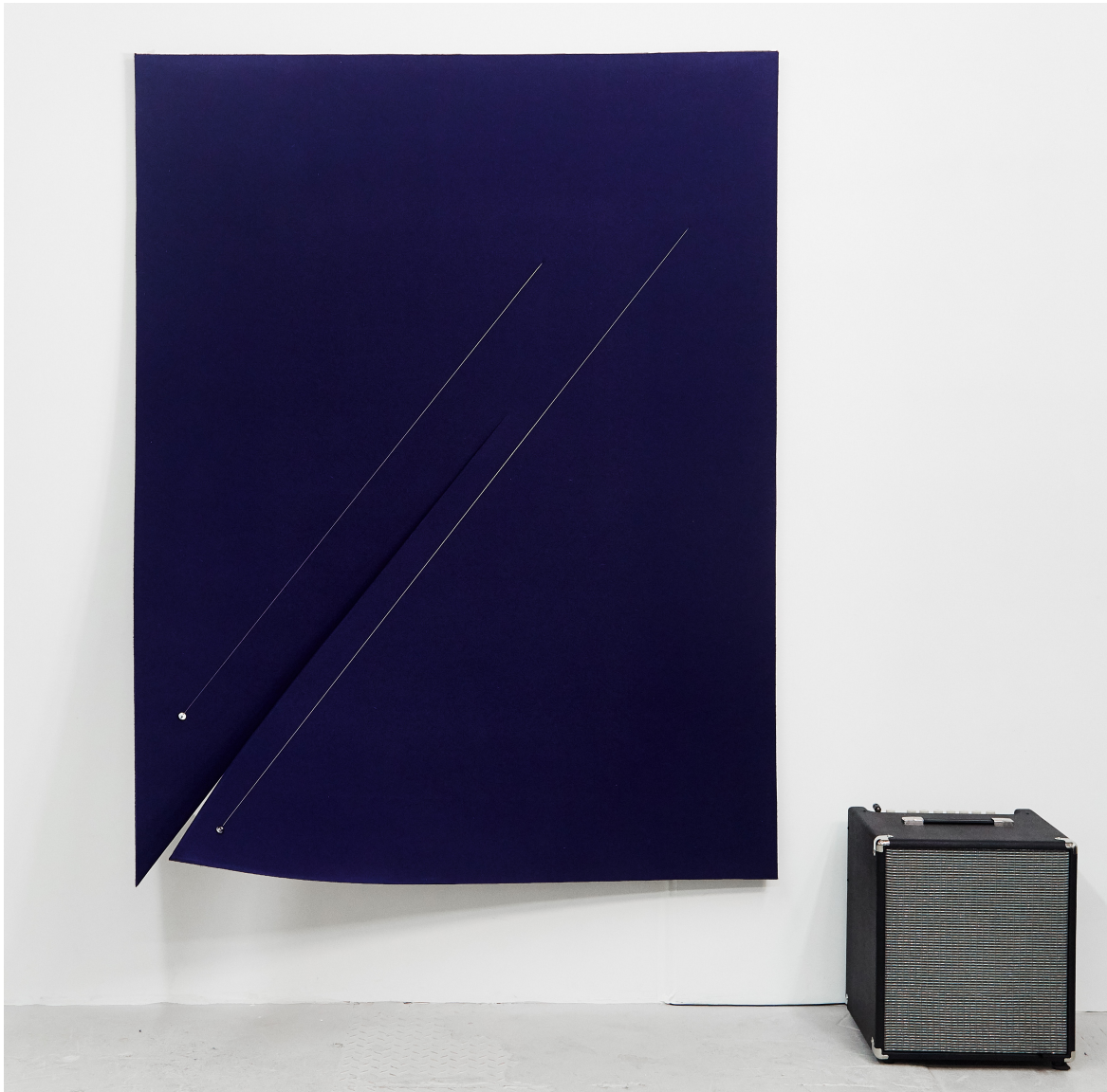
Work on Felt (Variation 19) Midnight, 2018 felt, carbon fiber, epoxy, guitar tuner, piano string, amplifier 75 x 58 1/4 x 25 7/8 inches

851 Springs Fireplace Road P:631.324.4666 www.thefireplaceproject.com