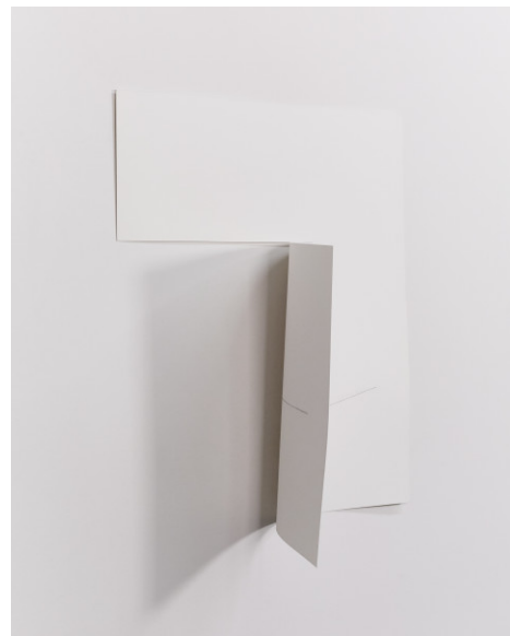
Work On Felt (Variation 16) Study, 2017

acid free and ph-neutral cotton paper, cotton thread, ph-neutral glue 27 1/8 x 21 3/8 x 11 inches