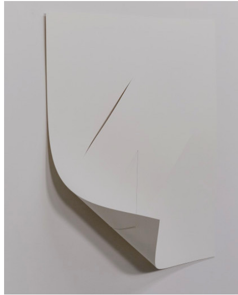
Work On Felt (Variation 14) Study, 2017

acid free and ph-neutral cotton paper, cotton thread, ph-neutral glue 27 1/8 x 21 3/8 x 11 inches