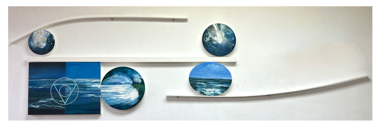
Water, 2023 oil on wood 24 x 90 inches

851 Springs Fireplace Road 435 Warren Street P: 516.398.8114 www.thefireplaceproject.com info@thefireplaceproject.com