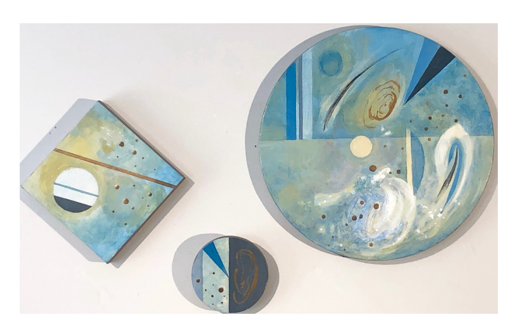
Notes of the Sea, 2019 oil on wood 12 x 22 inches

851 Springs Fireplace Road 435 Warren Street P: 516.398.8114 www.thefireplaceproject.com info@thefireplaceproject.com