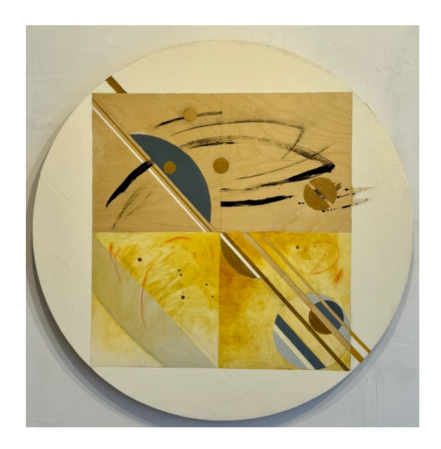
Constellation #7, 2018 oil on wood 29 inches round