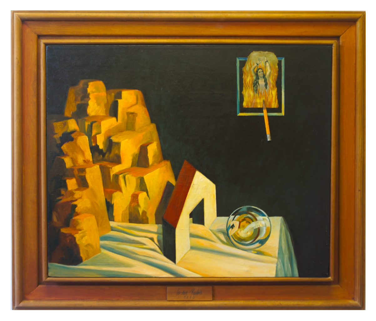
Still Life with Stolen Objects, 1985 mixed media on canvas 27 x 31 inches with frame

851 Springs Fireplace Road 435 Warren Street P: 516.398.8114 www.thefireplaceproject.com info@thefireplaceproject.com