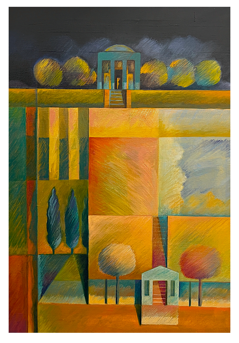
Planar Island, 1982 oil on canvas 34 x 24 inches