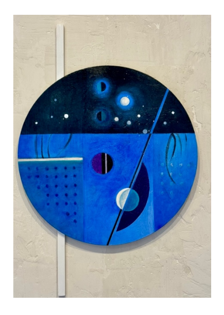
Night Shield, 2020 oil on wood 32 x 20 inches

851 Springs Fireplace Road 435 Warren Street P: 516.398.8114 www.thefireplaceproject.com info@thefireplaceproject.com