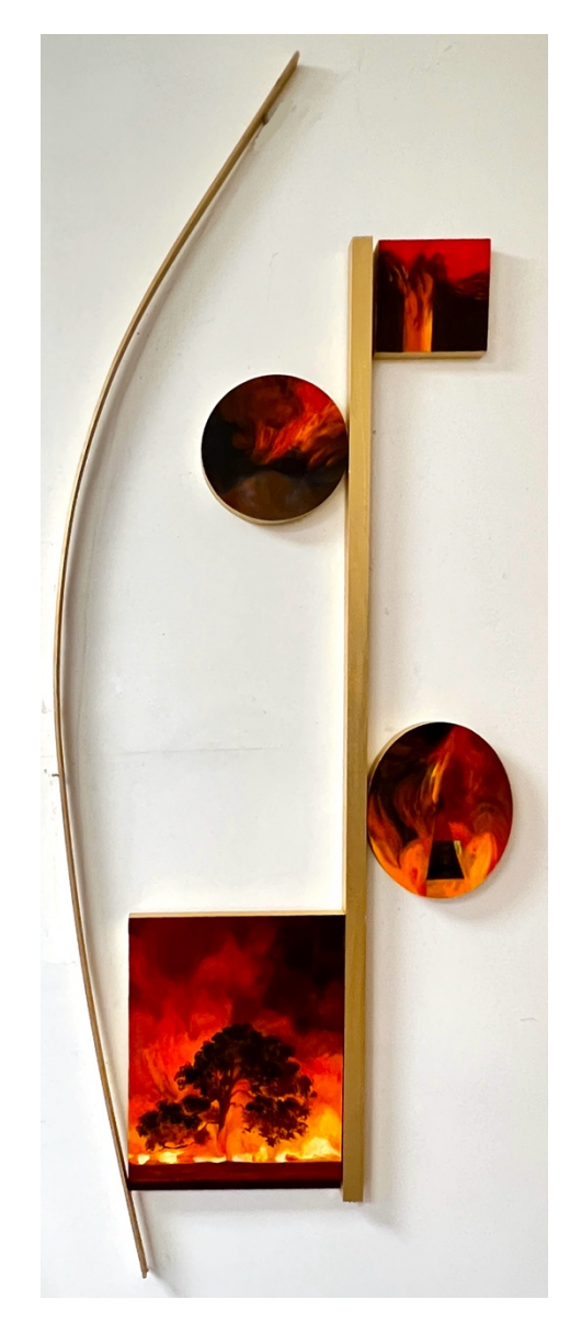
Fire, 2023 oil on wood 70 x 26 inches

851 Springs Fireplace Road 435 Warren Street P: 516.398.8114 www.thefireplaceproject.com info@thefireplaceproject.com