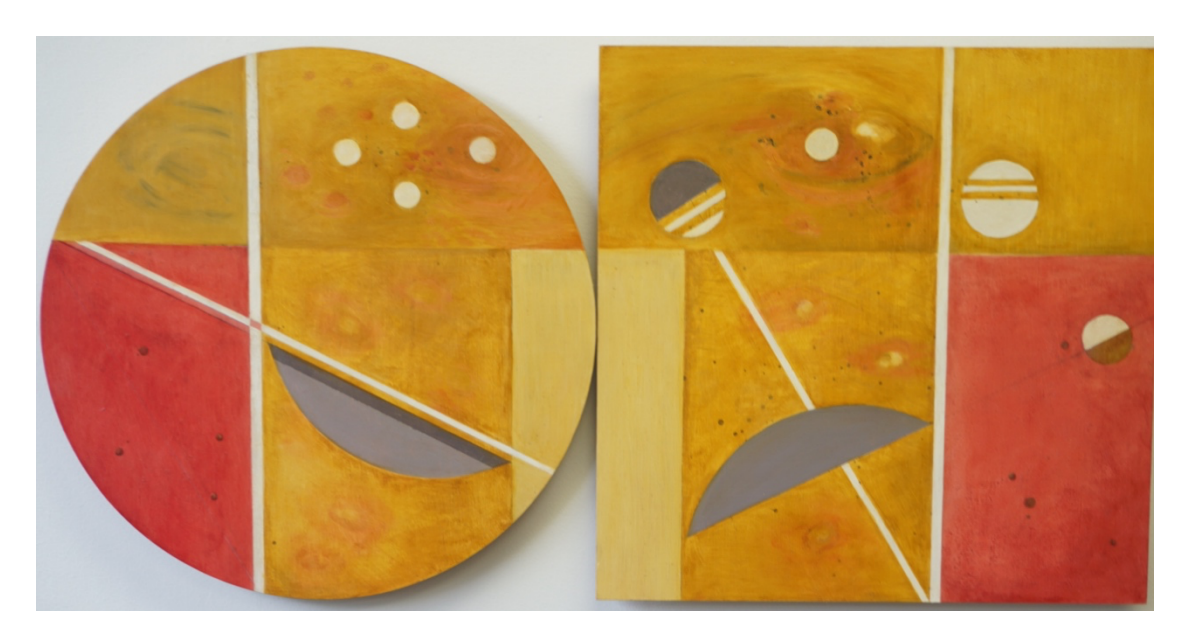
pink machine, 2017