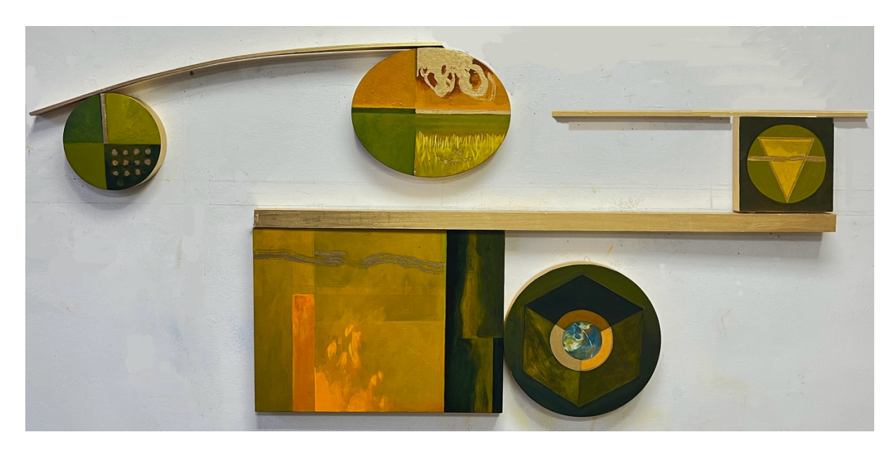
Earth, 2023 oil on wood 24 x 52 inches